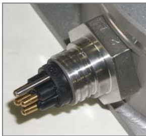
Photo above shows XB with PG9 Connector.